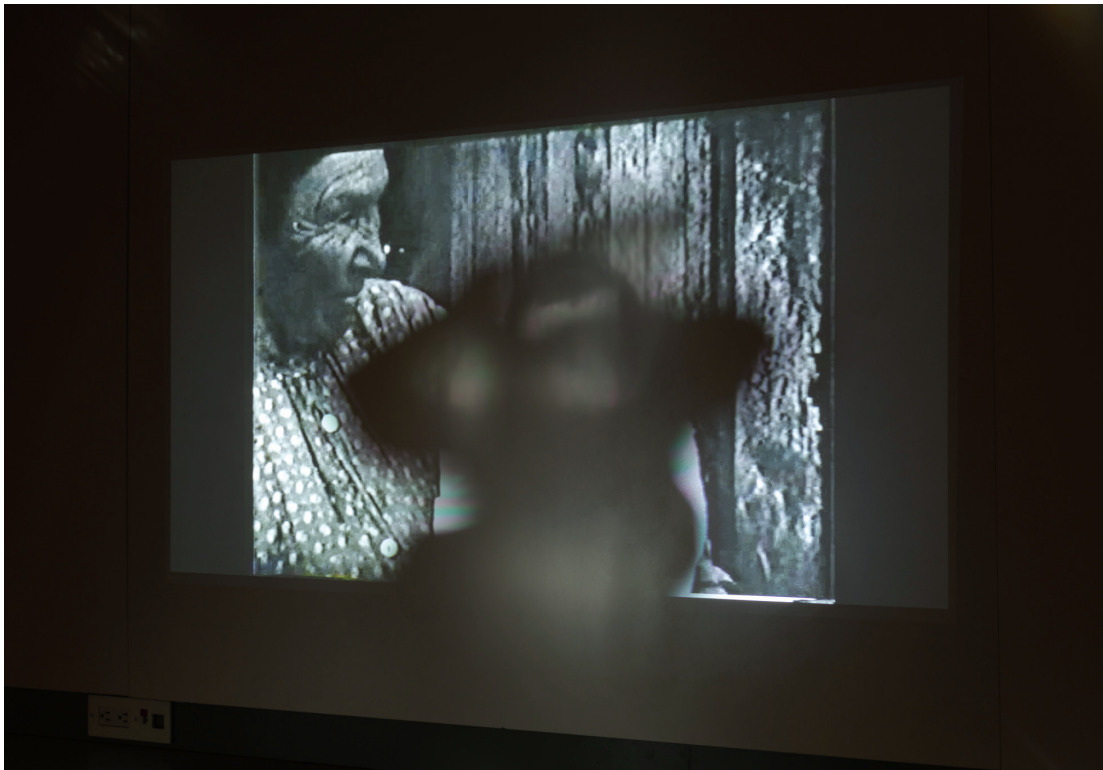
Only Available Light (detail), from the series Only Available Light , 2016. Archival film (Harlan I. Smith, The Shuswap Indians of British Columbia , 1928), projector, selenite crystals, and photons. 8:44 min. Original composition by Leela Gilday. PHOTO: DENNIS HA. COURTESY THE ARTIST AND GRUNT GALLERY.

Willard has screened the film in her home community at BUSH Gallery, during the Luminosity Festival programmed by the Kamloops Art Gallery, at the Vancouver Art Gallery for ReFuse , and Only Available Light was exhibited at Gallery 44 Centre for Contemporary Photography (Toronto).