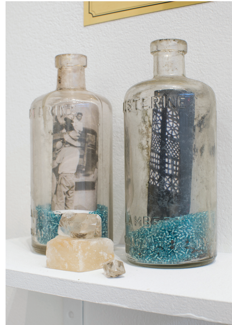
Tania Willard, Intergenerational effects (I found these in the BUSH) (detail), from the series Only Available Light , 2016. Vintage glass Listerine bottles, seed beads, and digital prints.

and the self-medicating work of communities addressing trauma in the wake of the residential school system and colonial experiences of Settler occupation. In the bottles, amongst loose beads the colour of mouthwash, partially obscured images show children in the back of pickup trucks on their way to residential school, and an image of the selenite windows in the Basilica of Saint Sabina, a historical church in Rome, Italy.