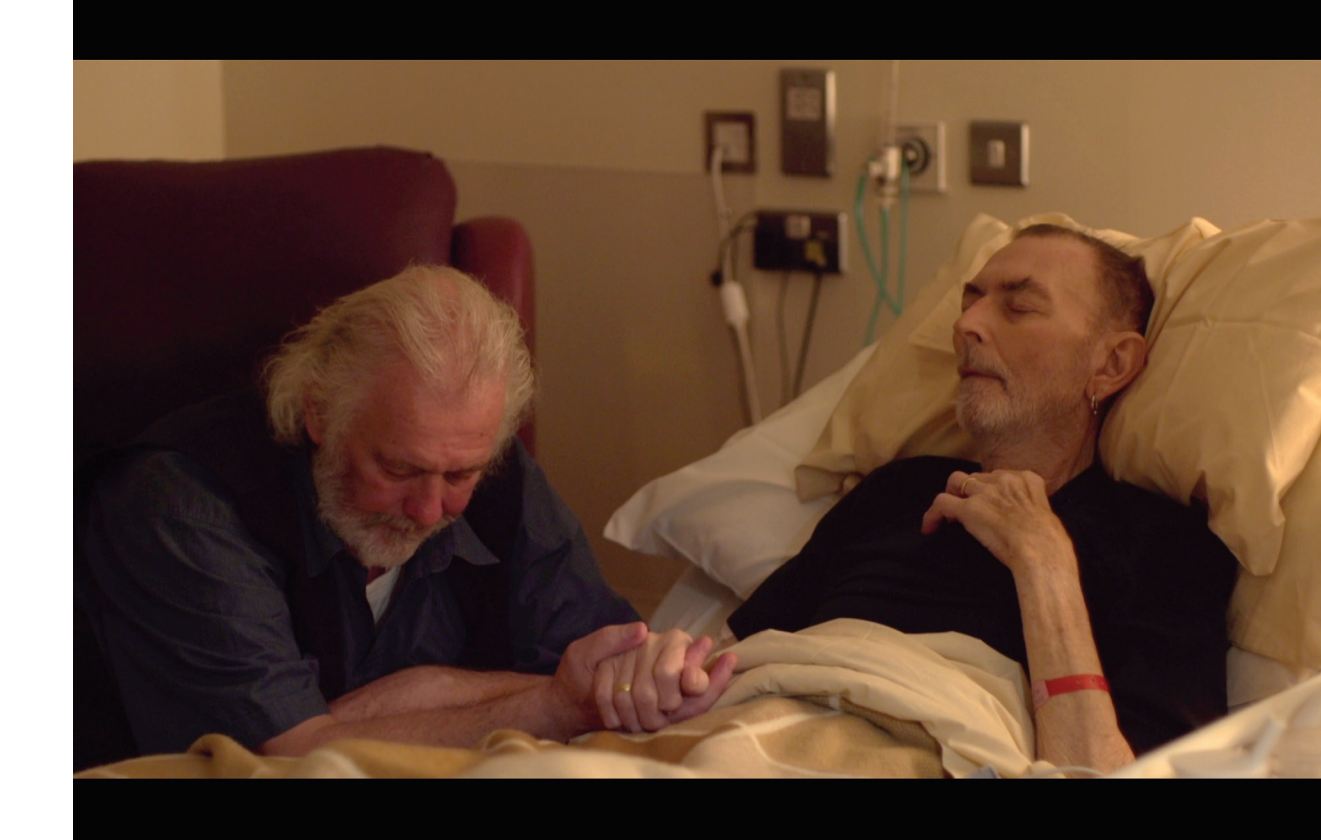
Steven Eastwood, Island (film still), 2017.

A complete list of presenters will be released in February 2018.